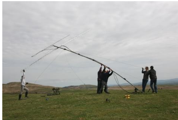
Erecting a contest antenna

Membership currently costs £18 per year and is open to anyone interested in amateur radio.